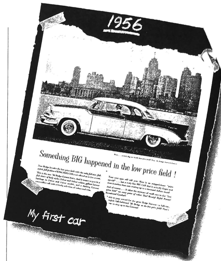
An advertisement in a scrapbook can show what was important to car buyers in the 1950s.

Nina and her grandfather looked at the model car from different viewpoints. Nina noticed how the car contrasted